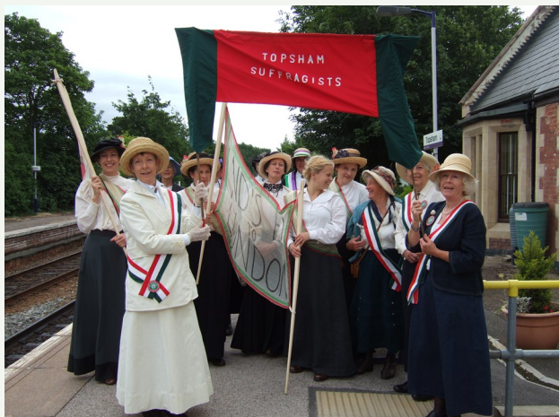
Marchers at Topsham Station