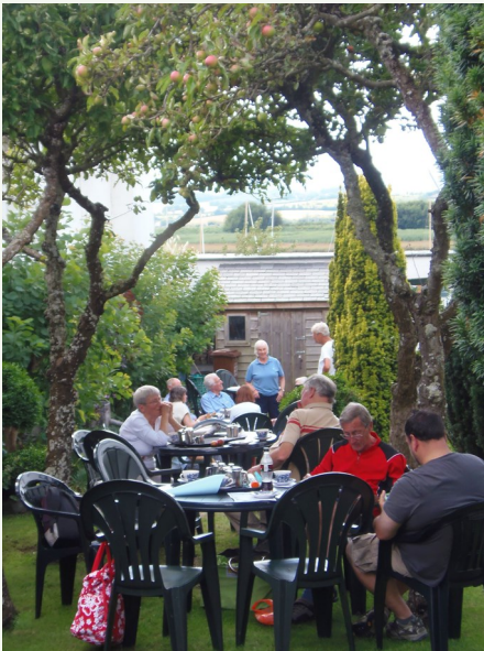
Visitors enjoying tea in the Museum garden

We are delighted to tell you that the tea room has done over 25% more business this year. The monetary value of this contribution to the museum society is extremely important. However, because it's “only serving teas”, I don't think the majority of us realise just how demanding a busy afternoon can be.