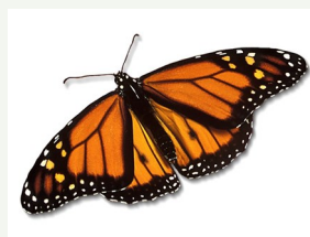
The Monarch butterfly

A visitor was recently shown the inside of the beautiful cabinet, dating from 1688, on long-term loan to the Museum from the V&A. As no one could tell him why the picture in marquetry of William of Orange featured a butterfly he promised to find out. His explanation was very interesting.